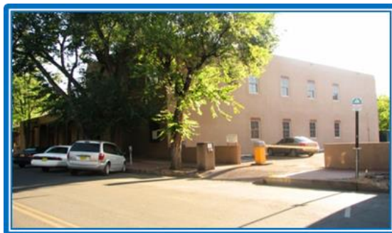
Controlled Access Parking