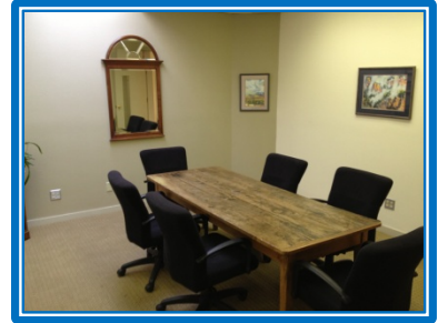
Shared Conference Room