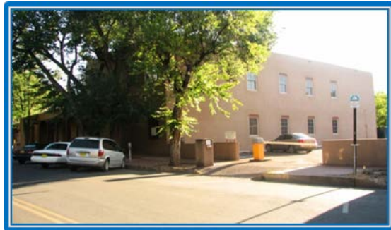
Controlled Access Parking