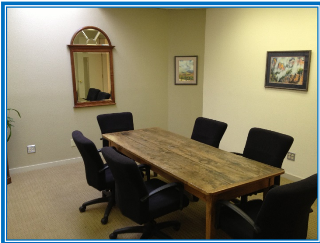
Second Floor Conference Room