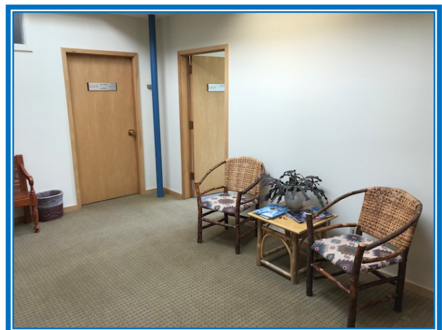
Second Floor Reception Waiting Area

MAIL P.O. Box 1477, Santa Fe, NM 87504-1477 PHONE (505) 986-0700 CELL (505) 470-2345