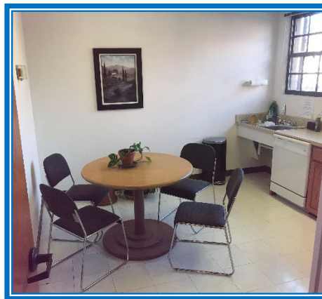
First Floor Breakroom

MAIL P.O. Box 1477, Santa Fe, NM 87504-1477 PHONE (505) 986-0700 CELL (505) 470-2345