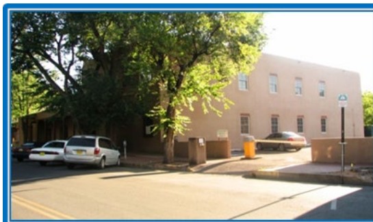
Controlled Access Parking

MAIL P.O. Box 1477, Santa Fe, NM 87504-1477 PHONE (505) 986-0700 CELL (505) 470-2345