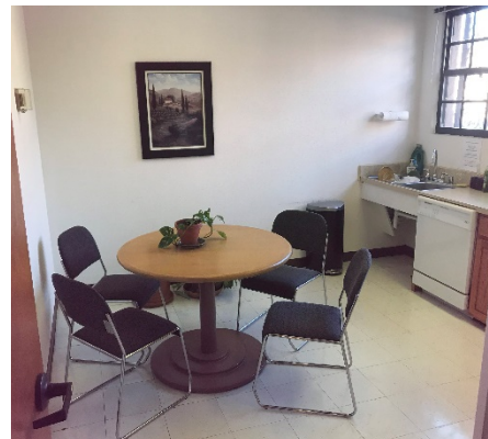
First Floor Breakroom

MAIL P.O. Box 1477, Santa Fe, NM 87504-1477 PHONE (505) 986-0700 CELL (505) 470-2345