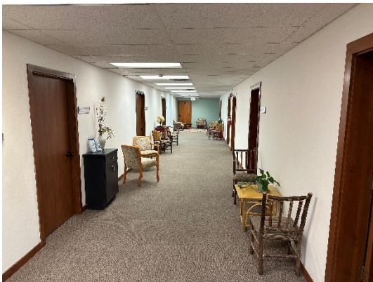
First Floor Corridor