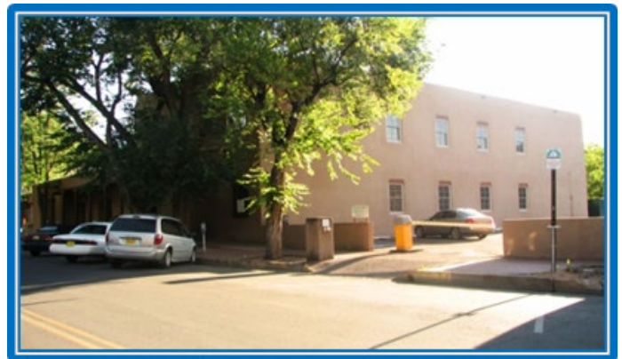
Controlled Access Parking