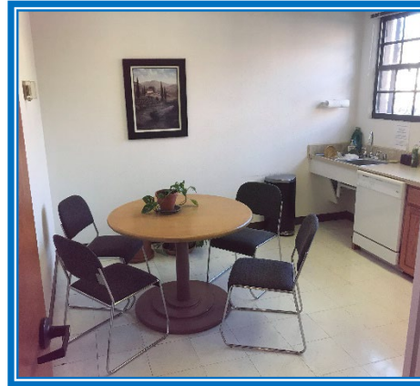
First Floor Breakroom

MAIL P.O. Box 1477, Santa Fe, NM 87504-1477 PHONE (505) 986-0700 CELL (505) 470-2345