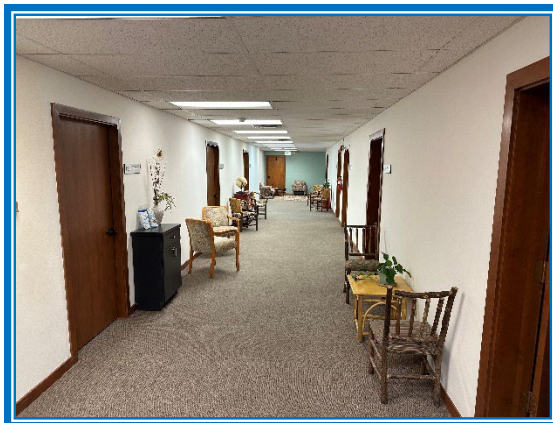
First Floor Corridor