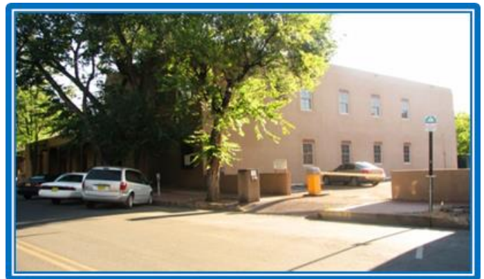
Controlled Access Parking