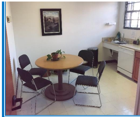
First Floor Breakroom

MAIL P.O. Box 1477, Santa Fe, NM 87504-1477 PHONE (505) 986-0700 CELL (505) 470-2345