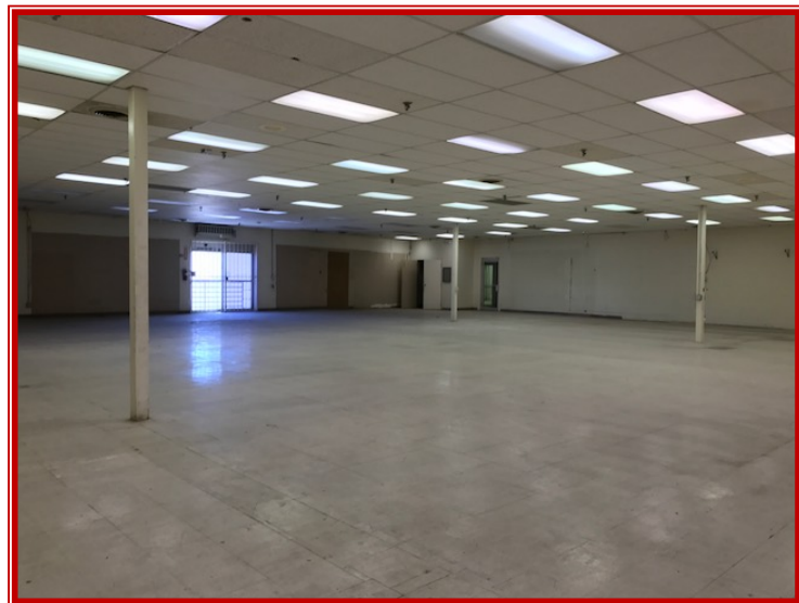
Retail / Showroom

MAIL P.O. Box 1477, Santa Fe, NM 87504-1477 PHONE (505) 986-0700 CELL (505) 470-2345