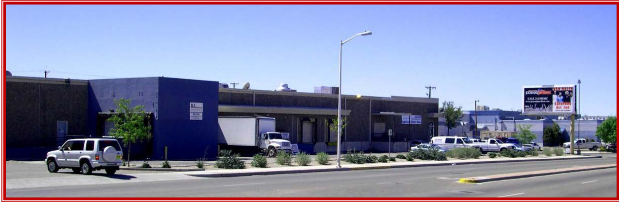
Comanche Road Frontage